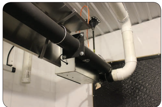
Figure 8. Radiant tube heater suspended in barn.