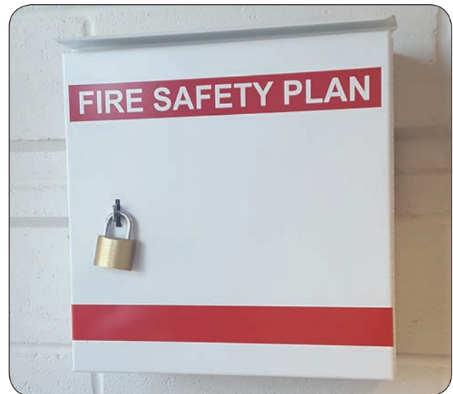
Figure 6. Fire Safety plan stored on site.