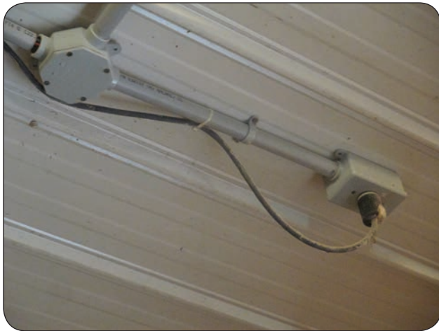
Figure 2. Temporary electrical equipment plugged into receptacle in livestock area.