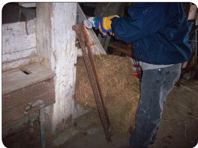
Figure 4. Grinding piece of steel in close proximity to combustible materials.