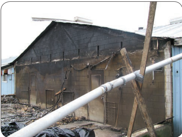
Figure 7. Example of an intact fire separation that did its job and prevented fire from spreading through the barn.