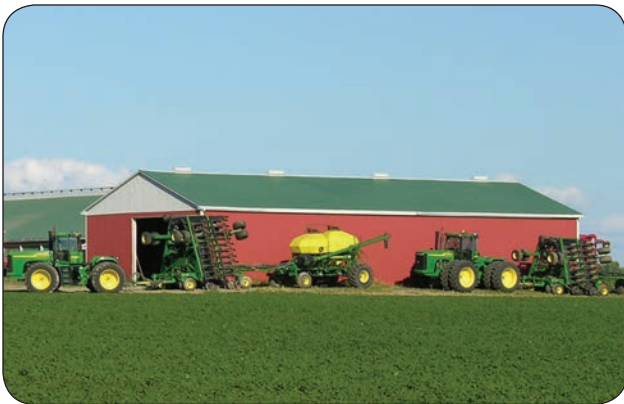
Figure 9. Equipment stored away from livestock housing.