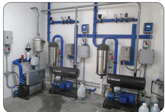
Figure 1. Equipment room free of clutter, dust and debris.