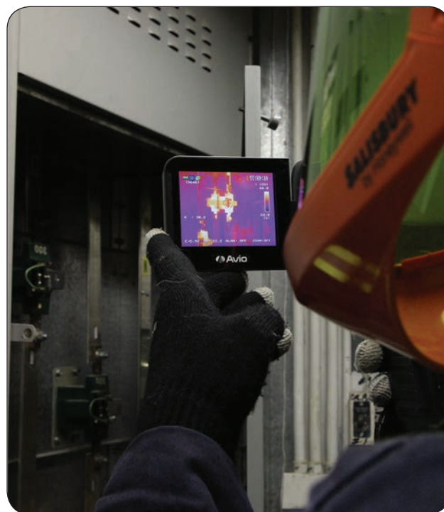
Figure 5. Inspection of electrical equipment by insurance company.