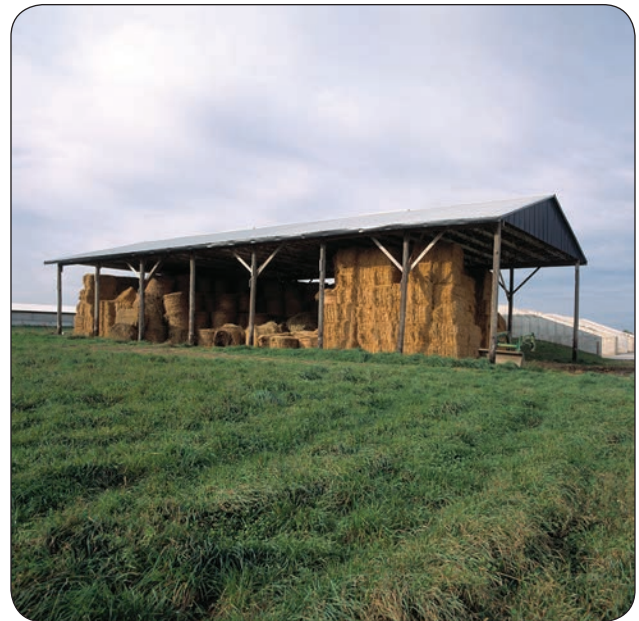
Figure 10. Separate storage building for hay and bedding.