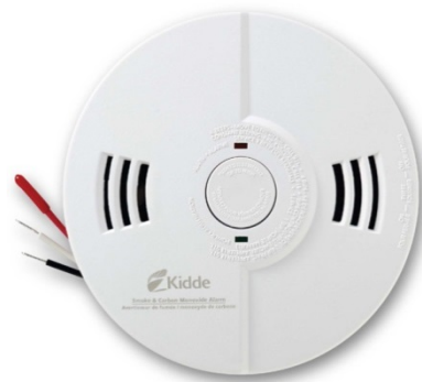
Front of unit with wire connectors

Under certain circumstances, the alarm can fail to continue to chirp when it reaches its end of life (after seven years), leading consumers to believe that it is still working.