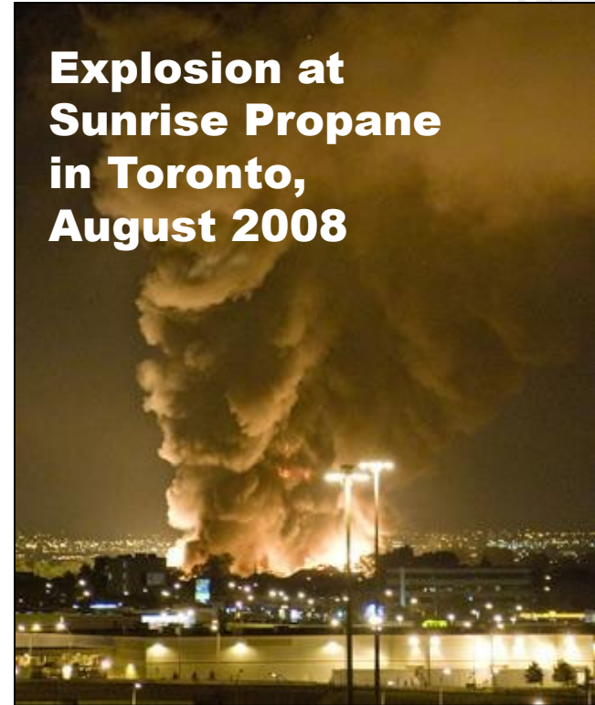
Explosion at Sunrise Propane in Toronto, August 2008