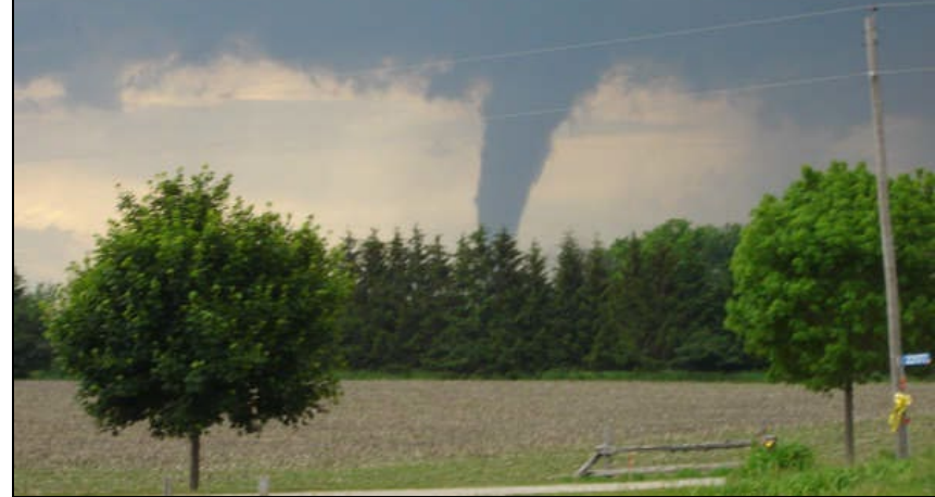
Tornado in Middlesex Centre, June 2008